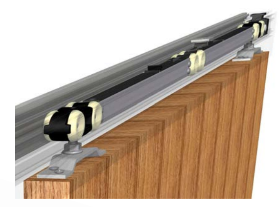
ALU100 IP SoftClose with left and right modules